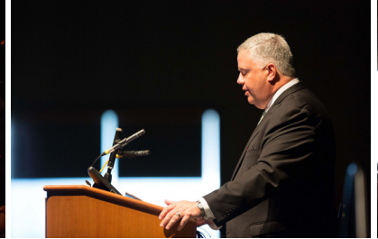
3-Year Outlook Luncheon