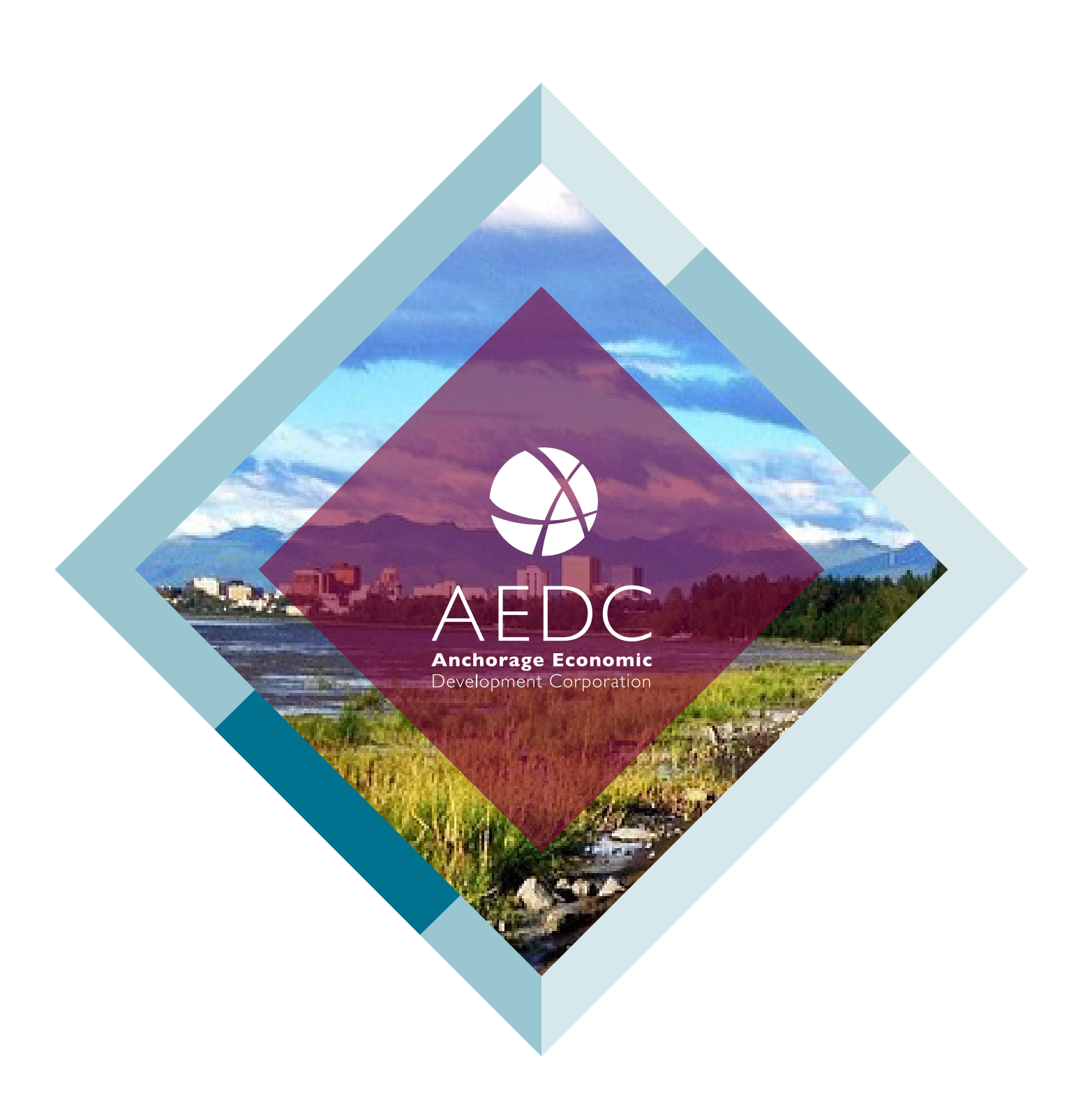
2014 Annual Report